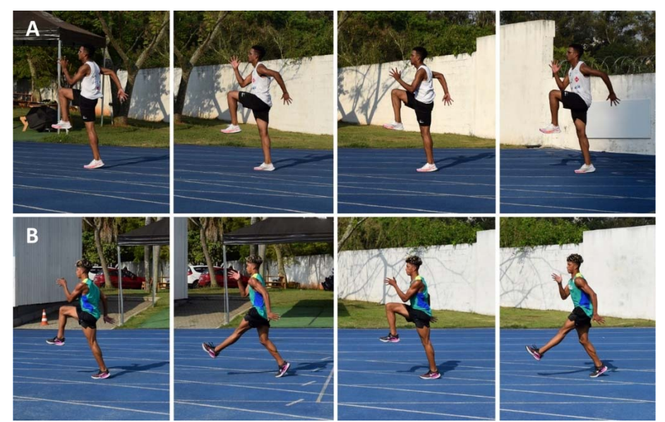
Figure 2*. High knee skipping (Panel A) and unilateral high knee skipping with extension of the lower leg (Panel B). These forms of skipping can be utilized to improve foot contact technique, leg extension mechanics, and the hip position while maintaining a more upright position, closely resembling the sprinting posture adopted during the top-speed phase. Both technical drills involve a vigorous arm action, with the hands moving from the hip to shoulder height. Sprint and jump coaches usually prescribe these drills over very short distances (e.g., 6–8 m).

Articles published in the Journal of Human Kinetics are licensed under an open access Creative Commons CC BY 4.0 license.