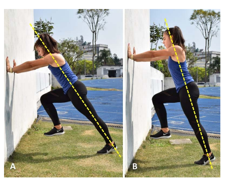
Figure 3*. "Wall drive" executed with two different trunk inclinations (i.e., ≥ 45°), to simulate the sprinting posture adopted at different stages of the acceleration phase of sprinting: early-to-mid acceleration phase (Panel A); mid-to-late acceleration phase (Panel B). Sprint and jump coaches usually prescribe these drills over very short duration (e.g., 5–6 s), gradually increasing the movement speed as technical proficiency improves.